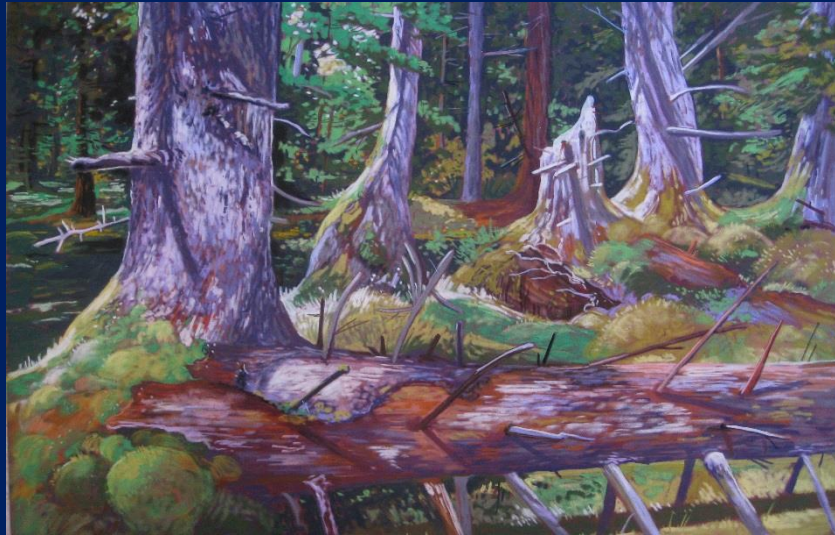
“Forest Floor”, Pastel, 22”x30”

In past years, I organized a visit to Hodgins Art Auction House to introduce my students to this part of the art world and we have always enjoyed the experience. It is still possible to go in for a private viewing of the spring art auction but you can view the selection online at www.hodginsauction.com . The complete catalogue will be posted soon for their June 22 auction date. This is my consignment for this spring: