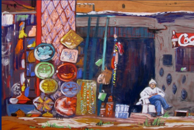
“Waiting for Customers” (Morocco), Pastel, 11”x14”

I have gone through my thousands of photos taken while on the road around the world and not only relived those experiences but was inspired to do some quick paintings.