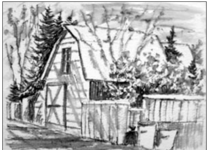
Sketch after water was applied