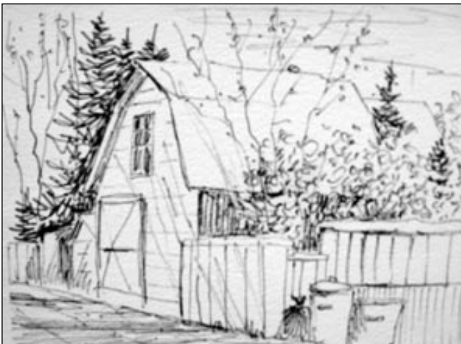
Sketch with soluble ink markers

These soluble markers come in different colours. Aside from a more monochromatic look in either black, blue or sepia, you may find it fun to experiment with vibrant coloured markers.