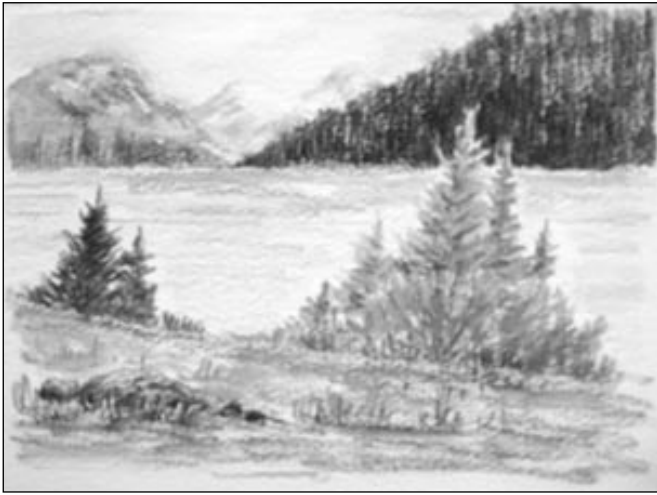
Watercolour pencil sketch after application of water