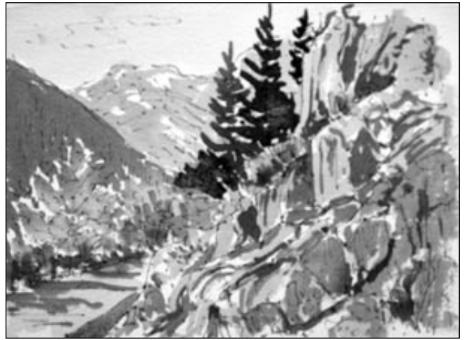
Ink sketch with watercolour applied

a) Sketch with the permanent marker (like a Sharpie Ultrafine), then fill in with watercolour paints in a precise or loose fashion.