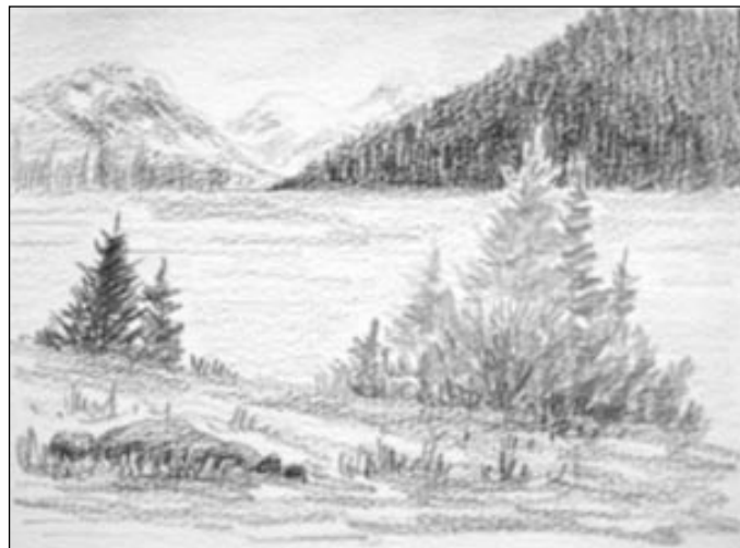
Watercolour pencil sketch before application of water

To add water to your W/C pencil drawing, all you need is the handy little water brush that already contains a water reservoir in its “belly” and releases just the right amount of water to move the pigment around. It's like magic! There is enough water in this brush to do lots of sketches!