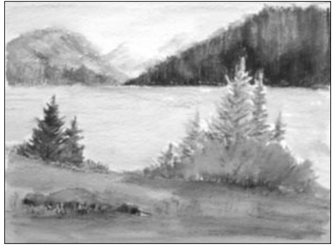
Watercolour pencil sketch after more water was added

The beauty of watercolour pencils is that you can leave as much of the “dry” look and apply as little or as much water as you wish. The more you go over the initial drawing with water, the smoother your application will be.